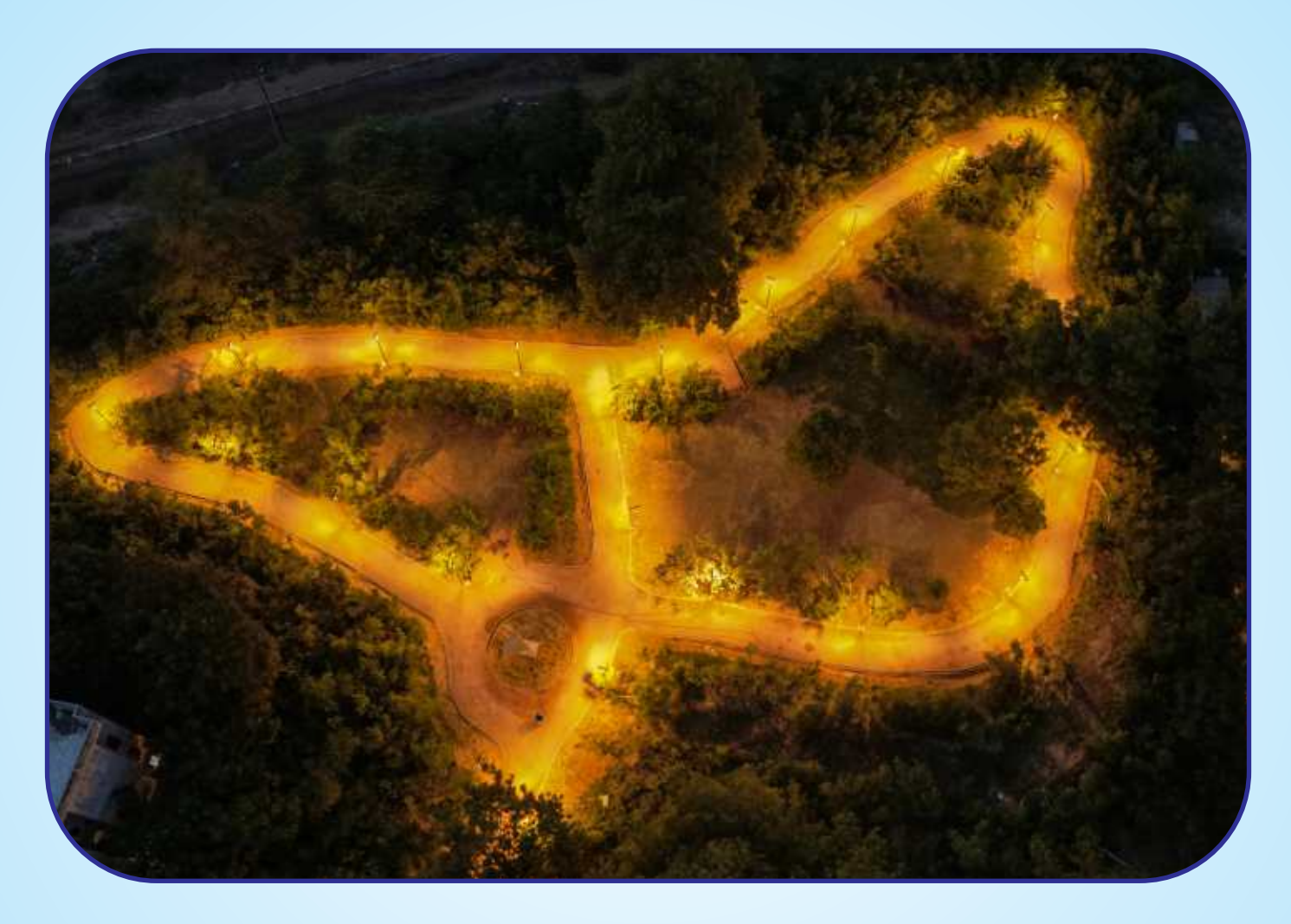
CREDAI GARDEN - PEOPLE'S PARK IN AFFILIATION WITH CREDAI AHMEDABAD CSR FOUNDATION

Regd. Office: CREDAI-AHMEDABAD House, B/h. Ornate Park, Near Maple County, Sindhu Bhavan Road, Thaltej-Shilaj Road,