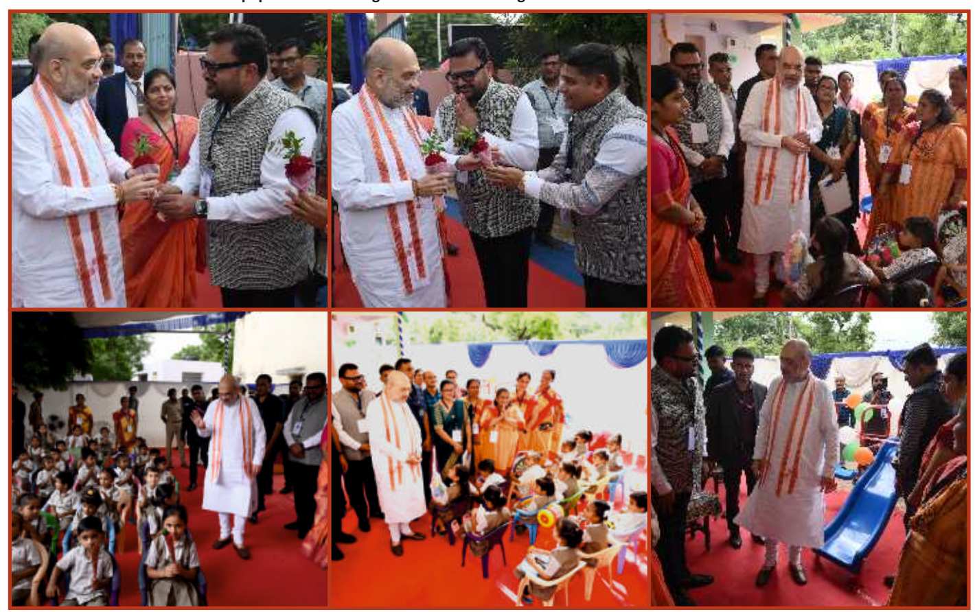
Meeting with Shri Bhupendrabhai Patel, Hon. Chief Minister